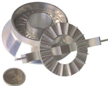
○ Shear cell approx. 30 ml, 2 EURO coin