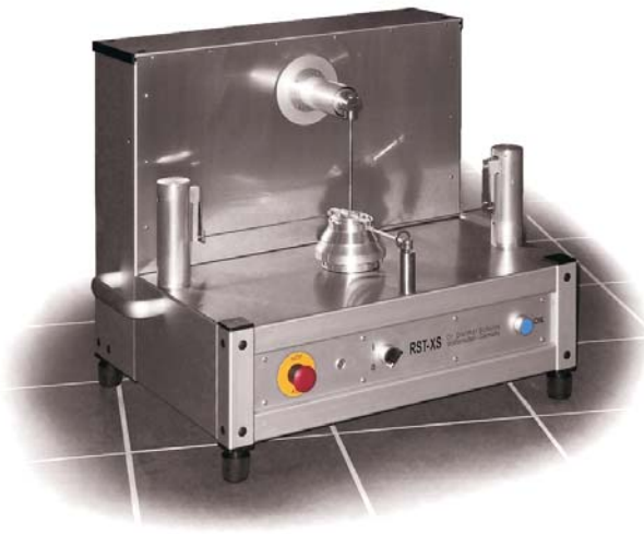
○ Ring Shear Tester RST-XS